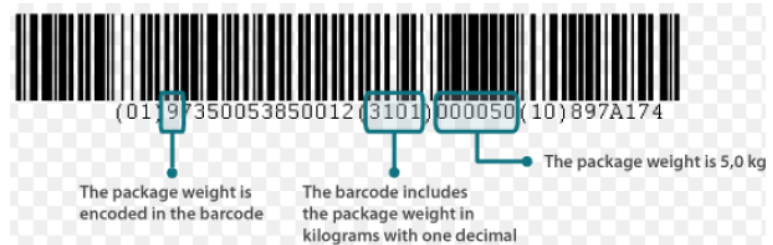
Figure 8 (GS1-128 Barcode for logistics):